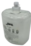
AT18606 8427950382420 Shampoo