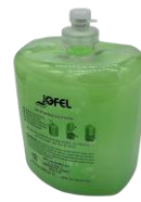
AT18706 8427950382437 Aloe