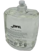
AT19806 8427950382444 Sensitive