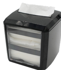
AH54000N 8427950356926 Black