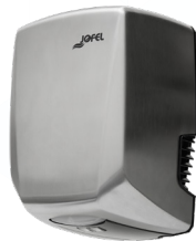
AA57500 8427950367540 Satin stainless steel finish