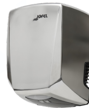
AA57000 8427950367502 bright stainless steel finish