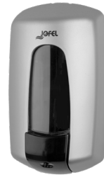
AC70300 8427950363597 Silver