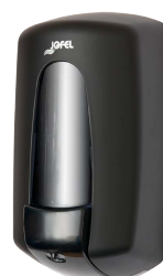
AC70600-MT 8427950349003 Matt black